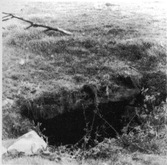
The entrance to a souterrain, situated in Larganboy, which has at least two chambers.

Claremorris Road we have the two at Holywell and also noteworthy is the old sandstone cross at the well. It is believed that a martyred Augustinian Friar is buried here, and speaking of Augustinian Friars we have our own very beautiful Friary.