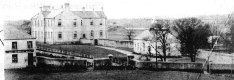
Convent School 1900