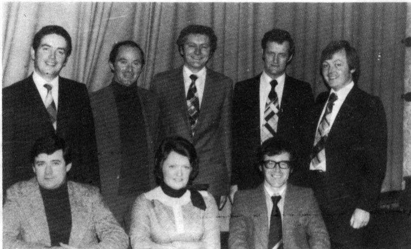
The Presidents of Junior Chamber in order of succession.

Clearly, therefore, Junior Chamber activities cater for various interests. Most of our members enjoy doing something constructive to develop themselves while at the same time making a positive contribution towards improving the community in which they live. If you are aged between 18 and 40 and interested in joining Junior Chamber we invite you to attend our next meeting.