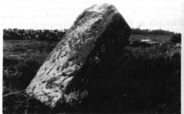
An Ogham stone in Bracklaghboy on which the writing is still clearly visible.