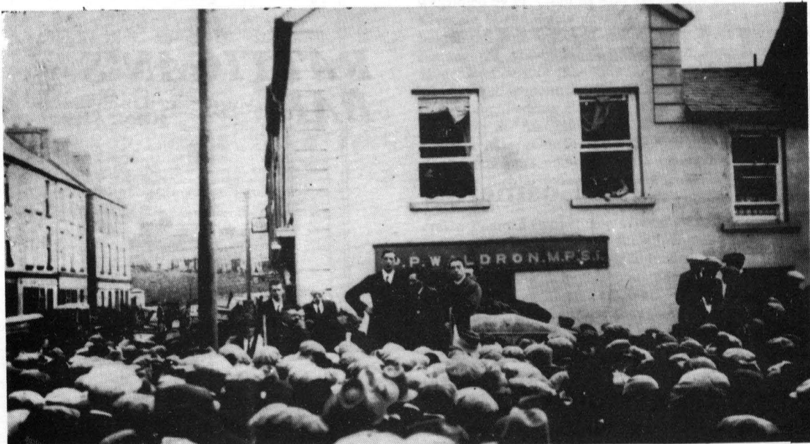
Mr. Eamon De Valera addresses a public meeting at The Square, Ballyhaunis in 1927.