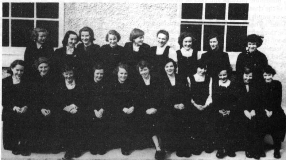
School Photo Junior Class 1952